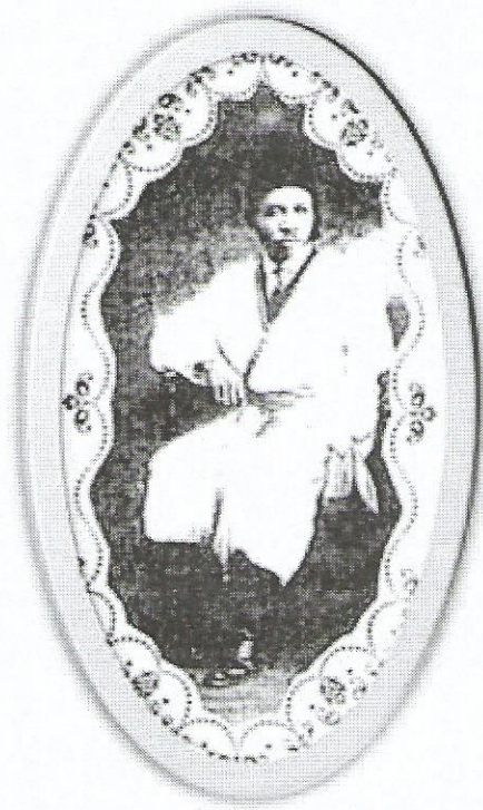
Prophet Noble Drew Ali January 8, 1886 - July 20, 1929

20. And by the hands of one, a merchant, going to Jerusalem, he sent this letter on its way.