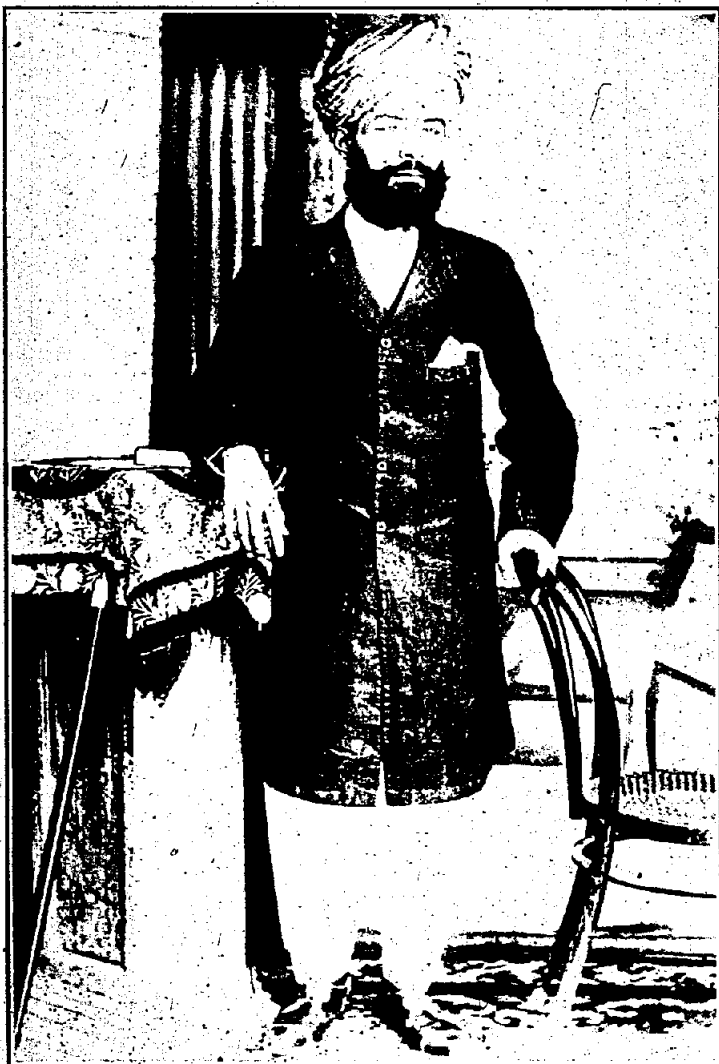
His Hazrat MIRZA BASHIRUD-DIN MAHMUD AHMAD

Second successor to the Promised Messiah and Mehdi and the present LEADER of the Ahmadiyya Movement in Islam. Head of the world-wide Muslim Mission of Peace, Truth and Union with God.