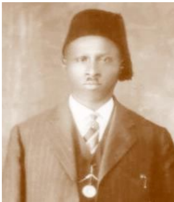
Establishment of a Religious Society