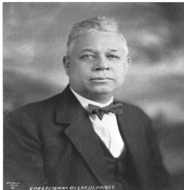
Hon. Oscar De Priest