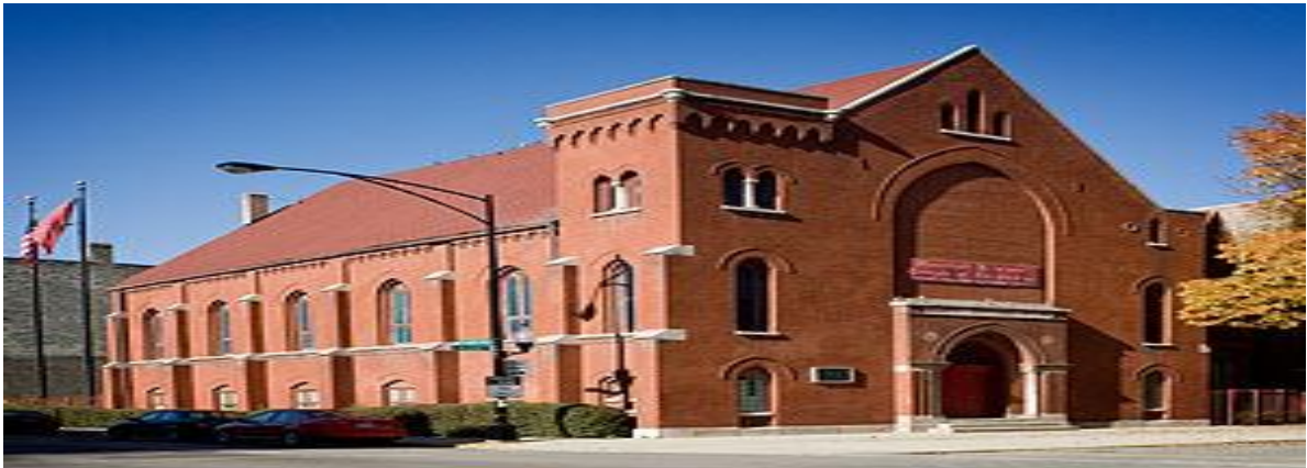
Moorish Science Temple of America, Inc./Convention Hall