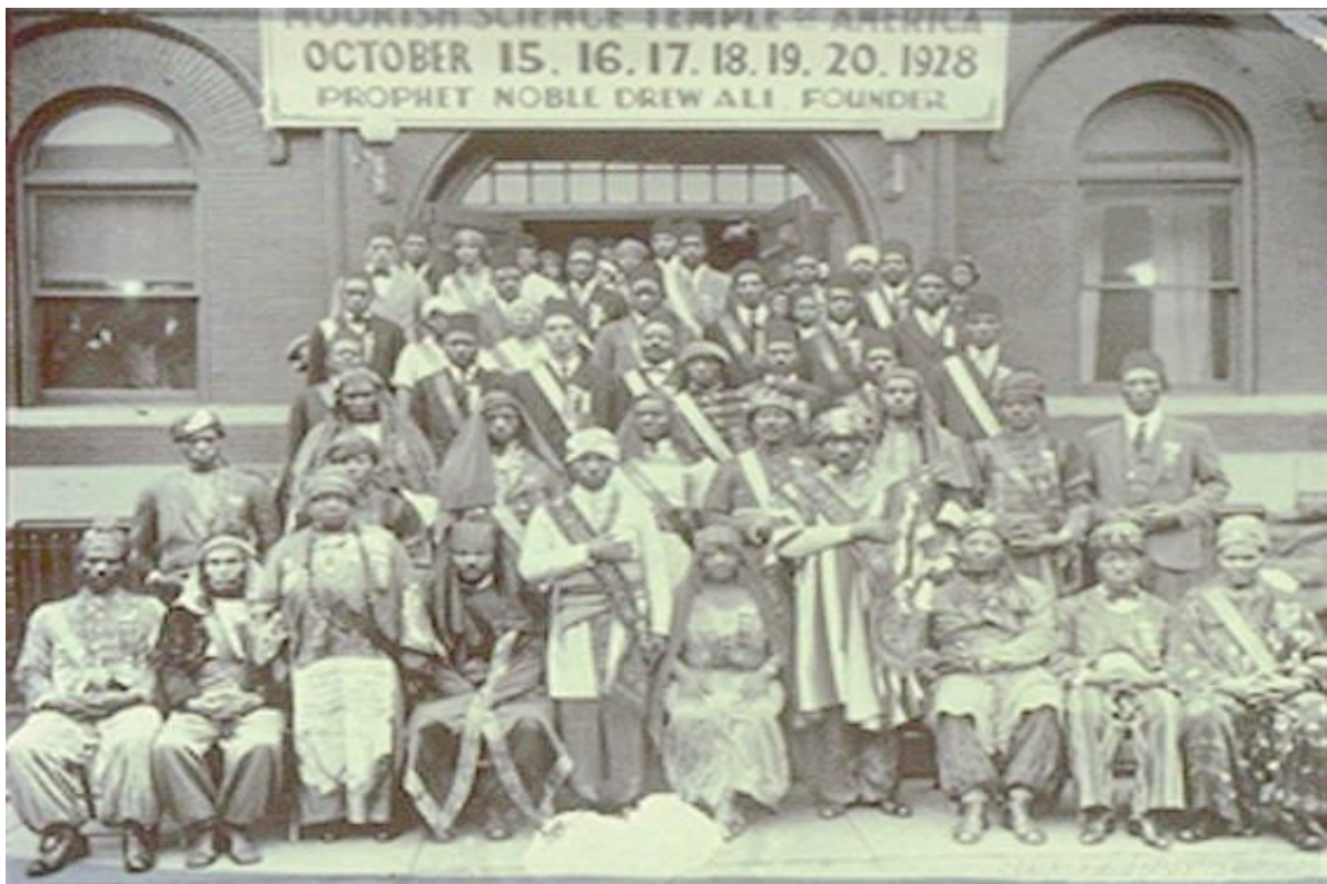
Prophet Noble Drew Ali with Convention Delegates and Temple Officials