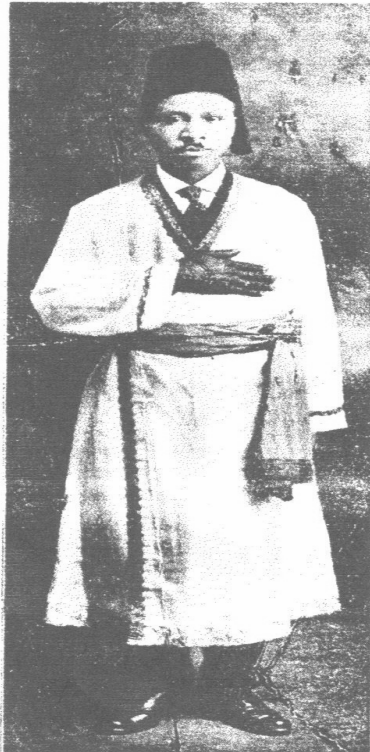
NOBLE DREW ALI